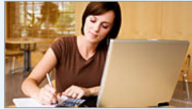
Sick of the office? Check out the top 10 home-based jobs