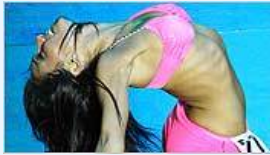
Finalists for the Celtics Dancers take the stage