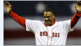
Recap Hall of Famer Jim Rice's career with the Red Sox