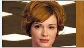
From a 'Mad Men' party to doggie treats, 21 cheap thrills