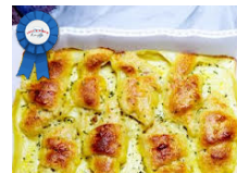
CHEESY CHICKEN CRESCENT ROLL