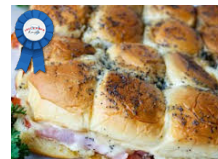
Hawaiian Roll Ham Sliders